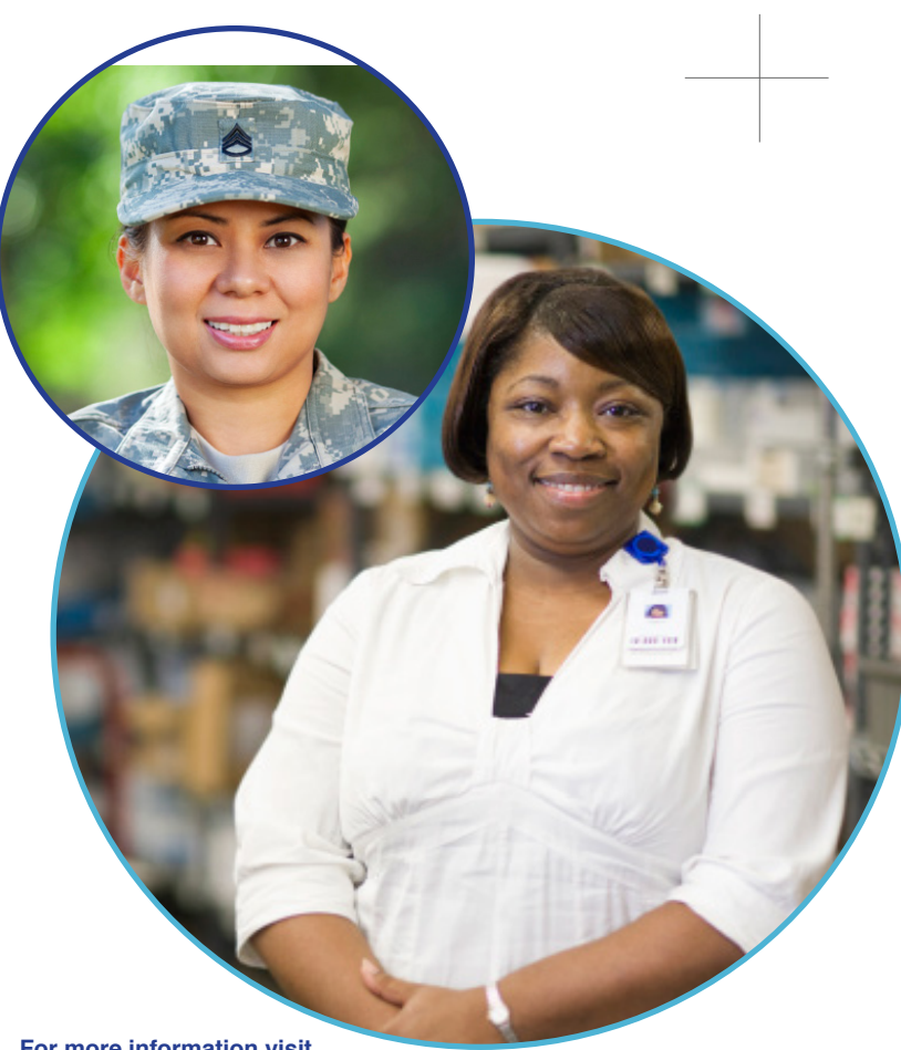
For more information visit www.retailmanagementcertificate.com

The Certificate is available to anyone wanting to advance or begin a career in retail and can be completed in as little as one year. Classes are offered online nationally and on campus at approved community colleges throughout the U.S. with new college partners being added daily.